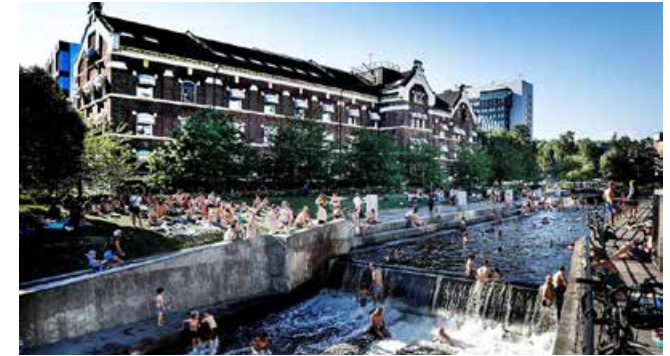
Nydalen in Oslo, where the old brick buildings add character and charm to the district.

Buildings should be built with quality to last for many hundreds of years. Today, buildings are planned to last for 60 years or less, and many modern buildings are demolished long before this. Today, we also see that many magnificent buildings with a strong identity are empty. How can we work with these buildings to ensure they become bearers of culture in the future? 20)