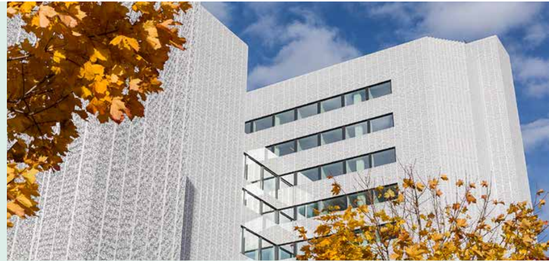
Illustration: Photo: T. Lauluten/FutureBuilt

In addition to the amount of emissions, it is important to assess when emissions occur. Emissions associated with the production of materials are happening right now, at a time when it is most critical to reduce them. By reducing our material consumption, we will therefore reduce the emissions related to the embodied carbon of the building immediately. Reductions based on reduced energy consumption i.e. for heating, cooling and electricity, produce far less of an effect per year throughout the service life of a building.