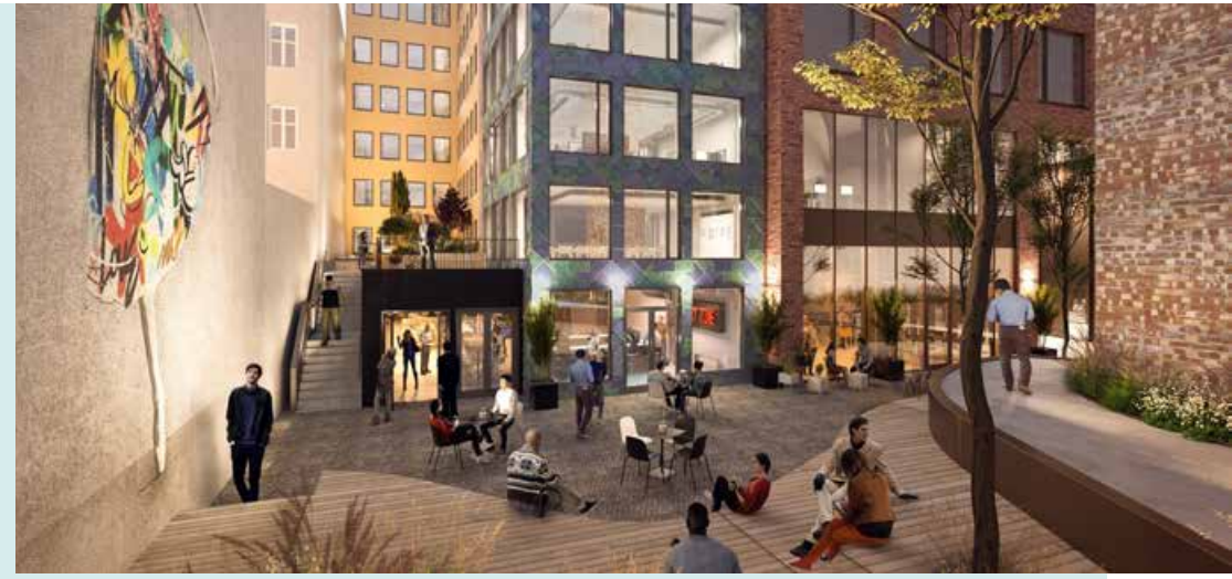
Illustration: Entra ASA/Mad