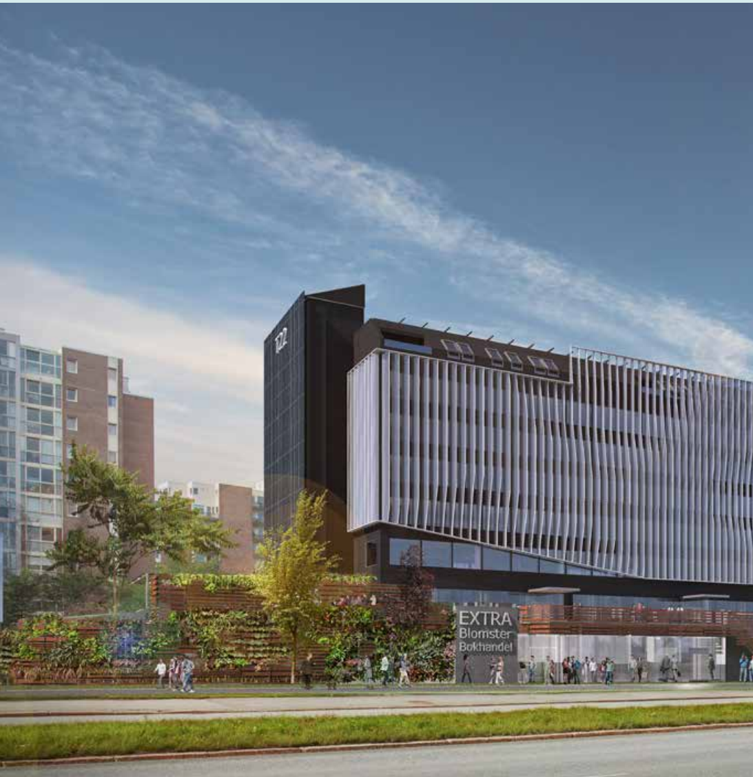
Illustration: KLP Eiendom