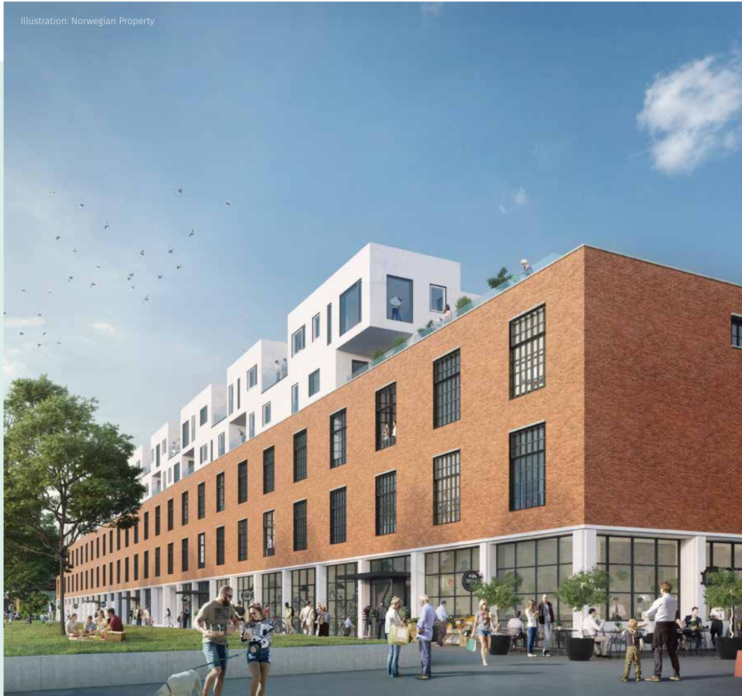
Illustration: Norwegian Property

The original building was robust, but lacked life and content. The development has 223 flats, while the ground floor houses trades and services needed in a city. With its 50,000 square metres of floor space, the building was the largest of its kind in the Nordic region when it was completed in 1932. As an industrial facility, it was 'state of the art', and the building was considered an icon of its time in architectural terms. 21)